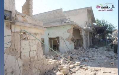
Regime forces targeted Tal Refaat city on the morning of 09/07/2014 with areal shells, injuring civilians